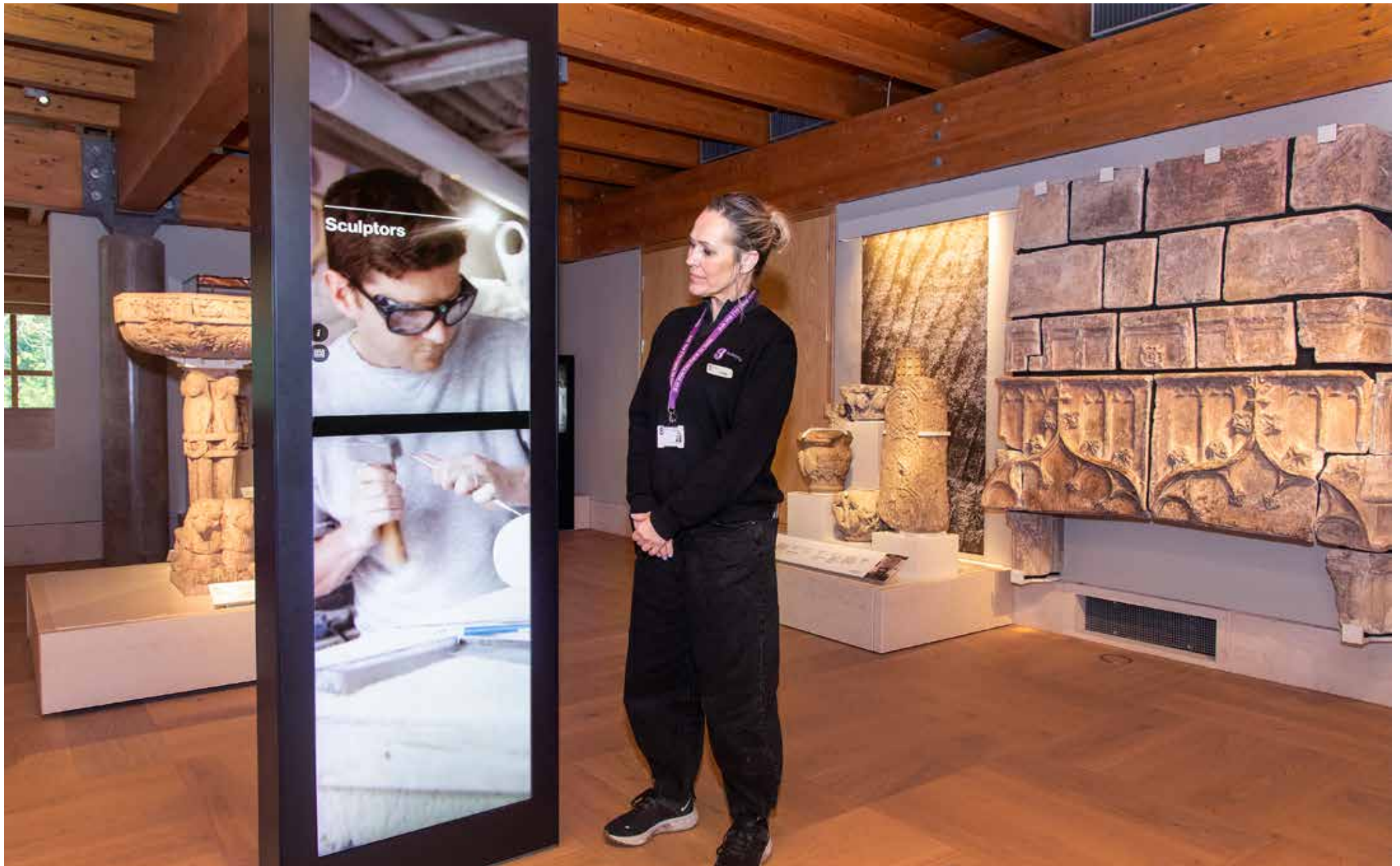
This is upstairs. You can watch and listen to films.