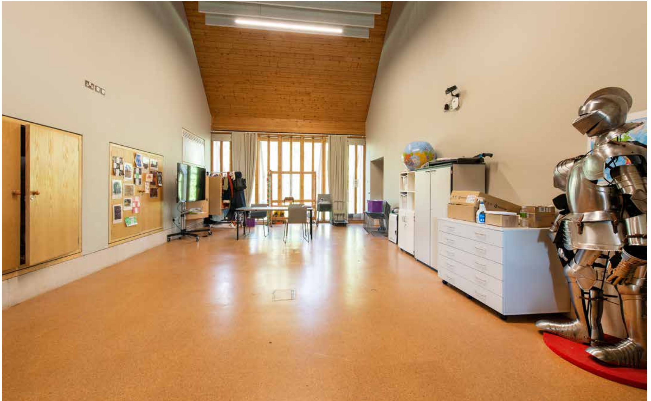
This is the Learning Room. Schools visit this space with a learning assistant. Sometimes this space is closed.