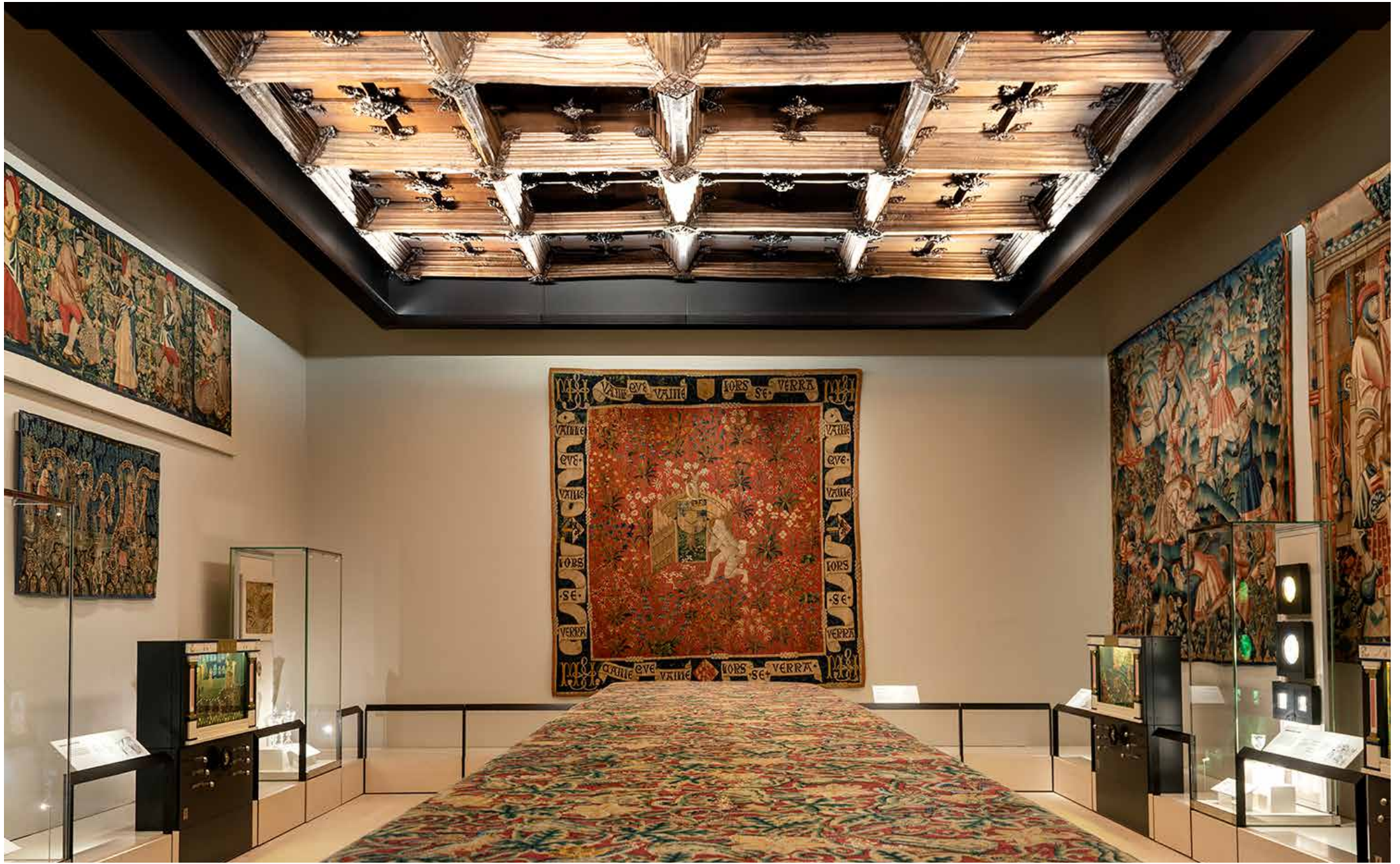
There are objects and art works on the ceiling, on the walls, in glass boxes, and on the floor.