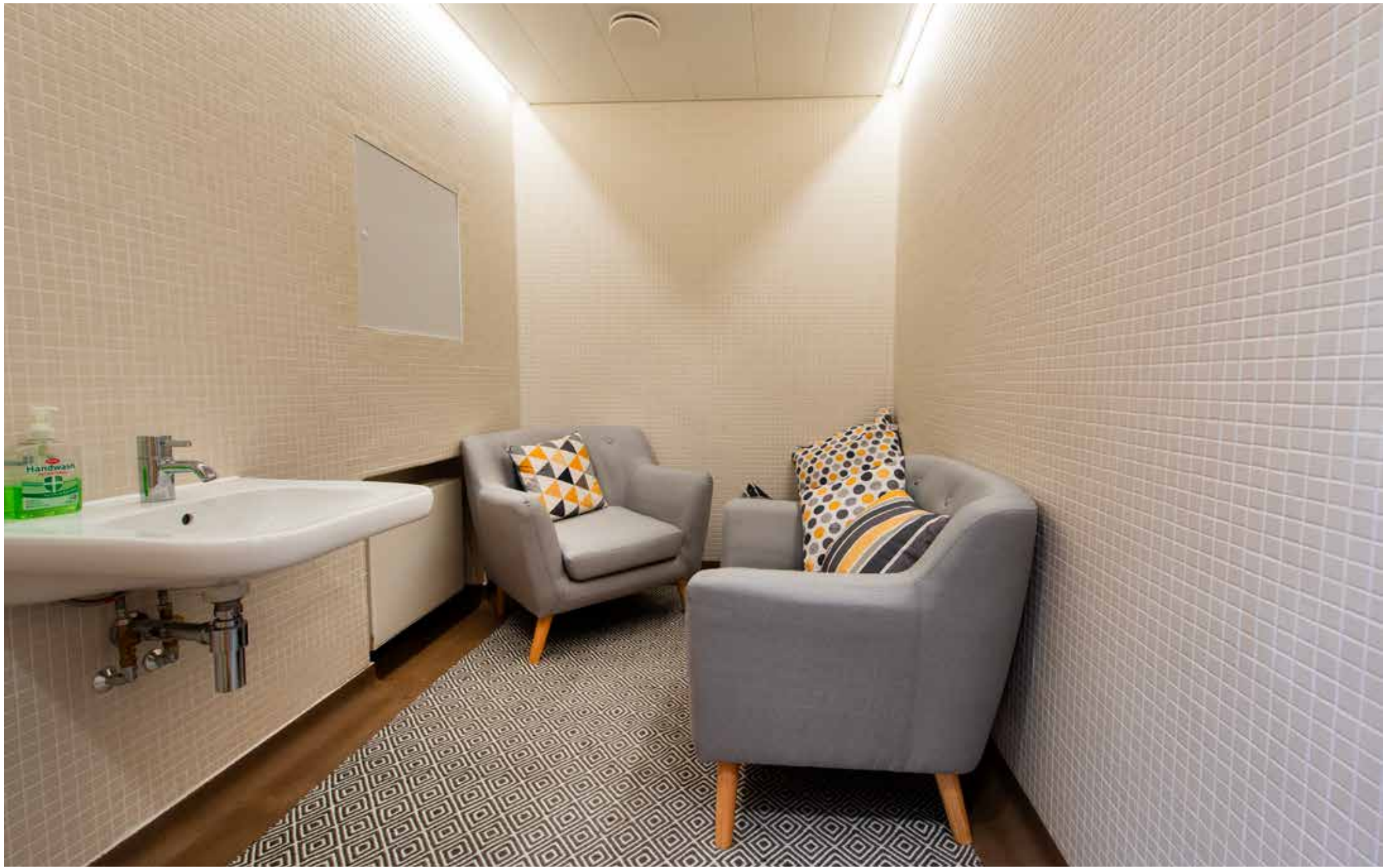
There is a quiet room.