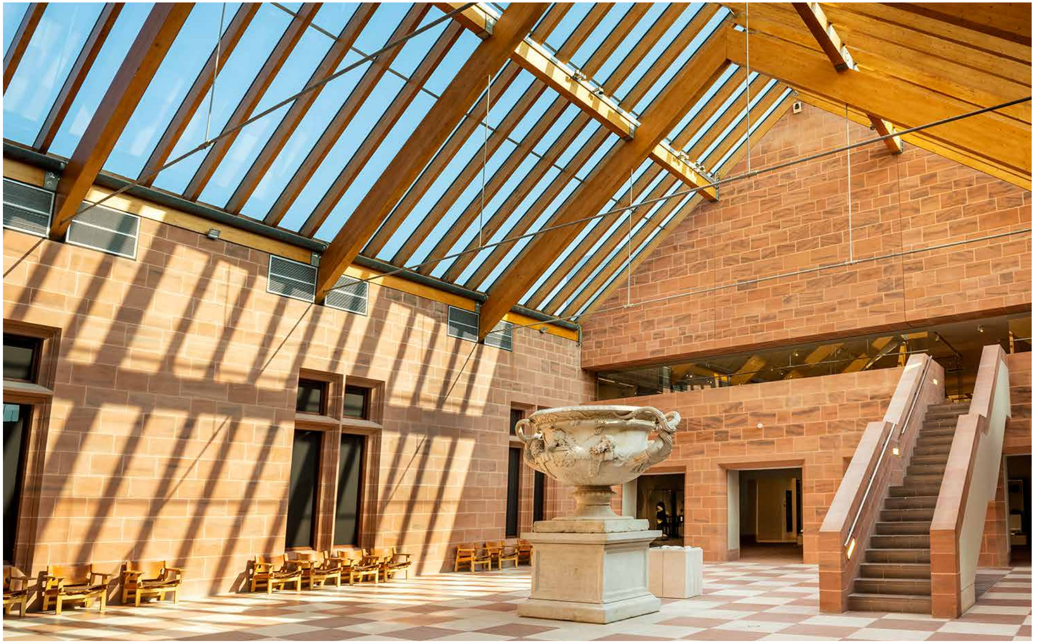
This is the Courtyard. You can sit here.