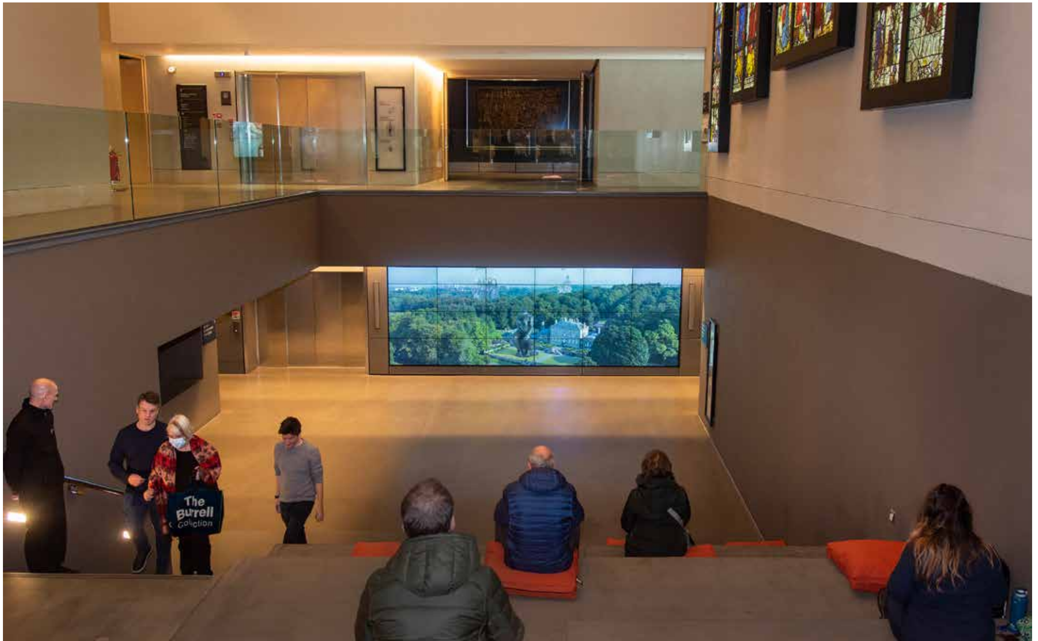
This is the Central Stair. You can watch films on very large screens.