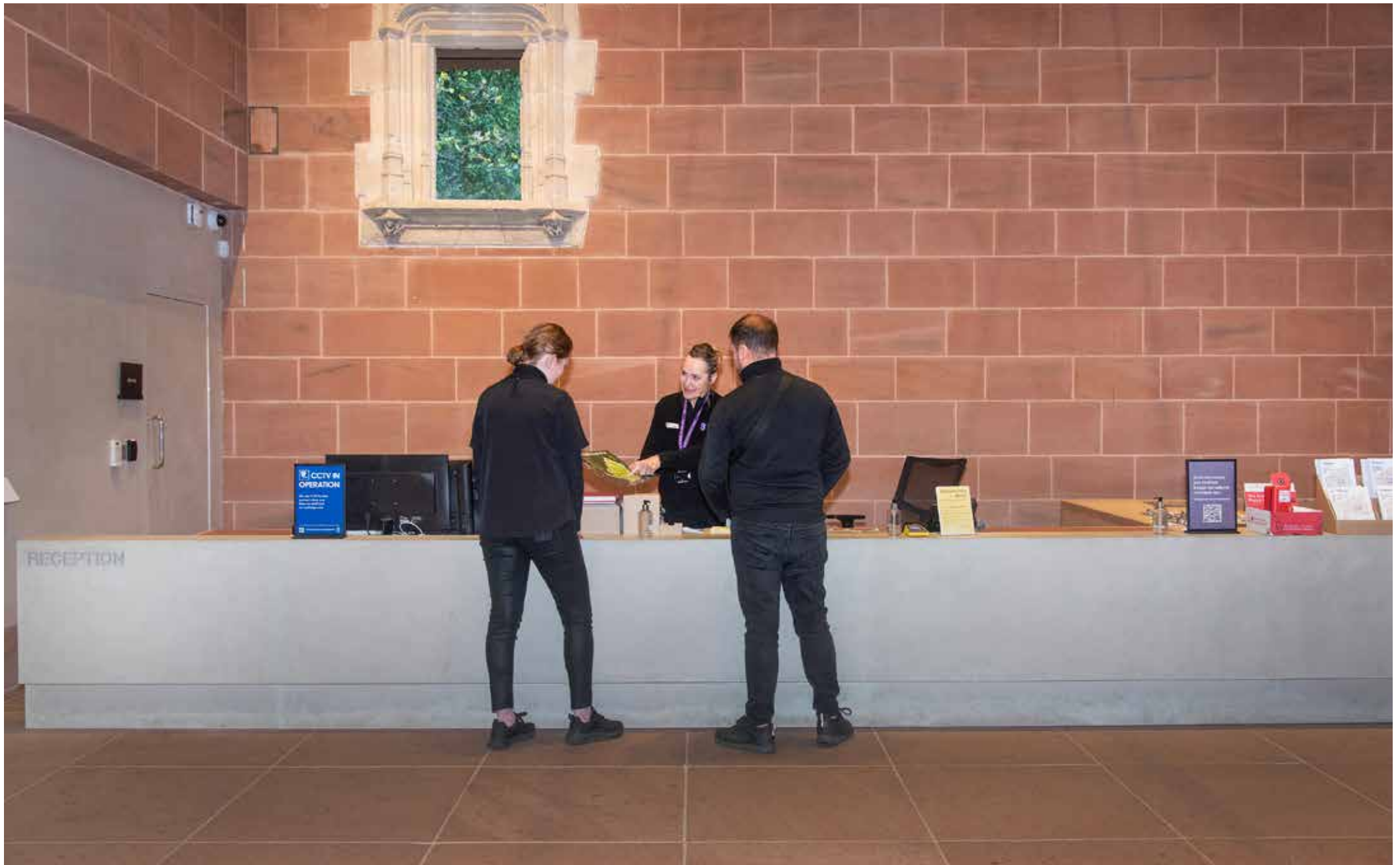
The Enquiry Desk is to your left. A gallery assistant can help you.