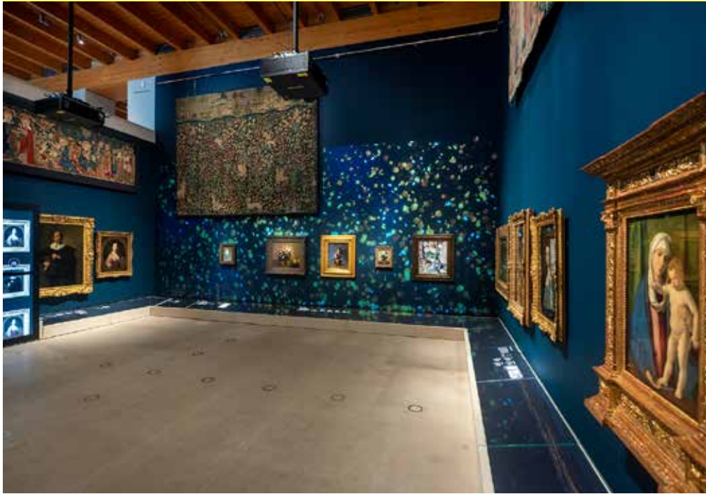
Some rooms are dark. Some rooms can be bright.