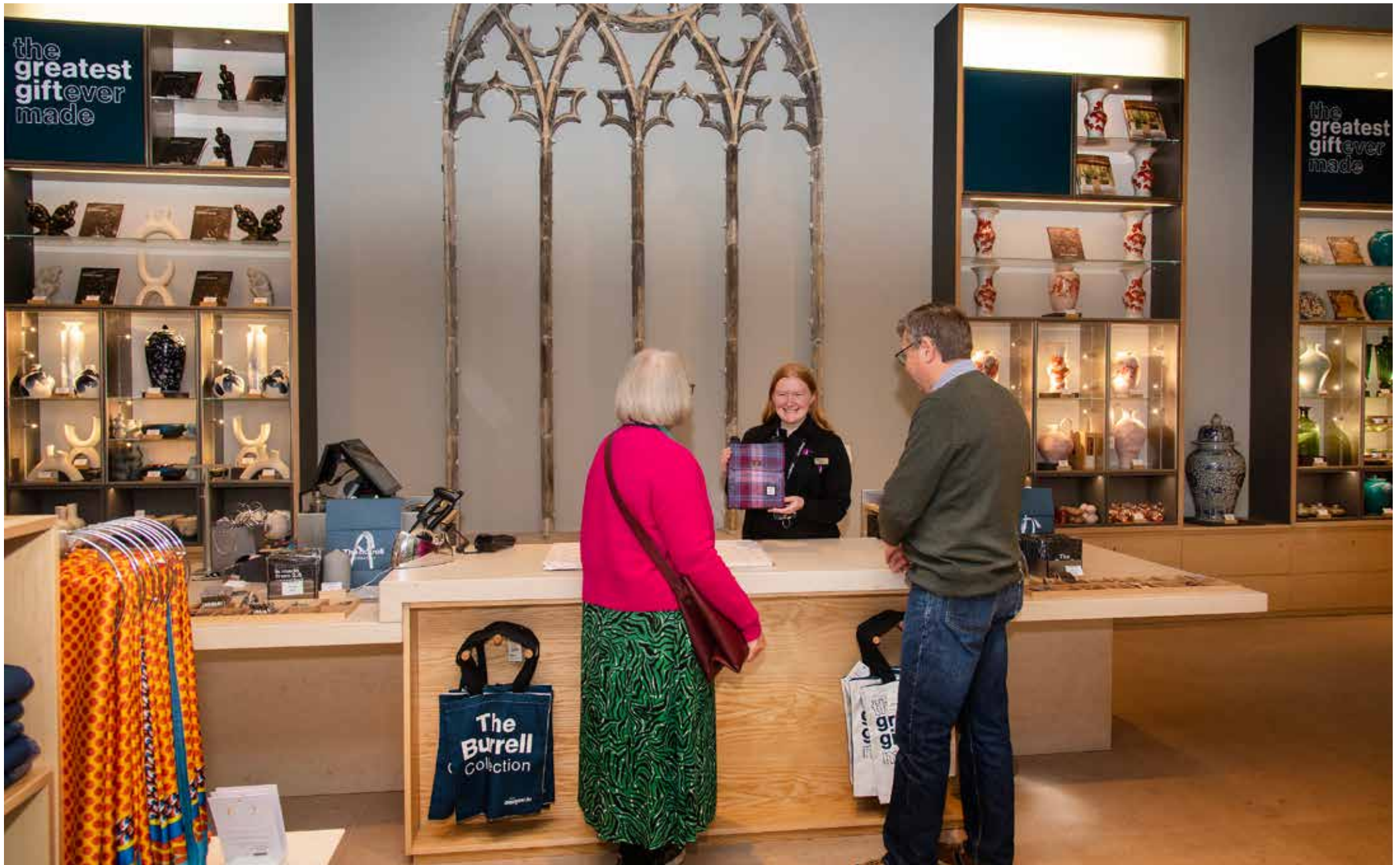
The Shop is to your right. You can buy gifts here.