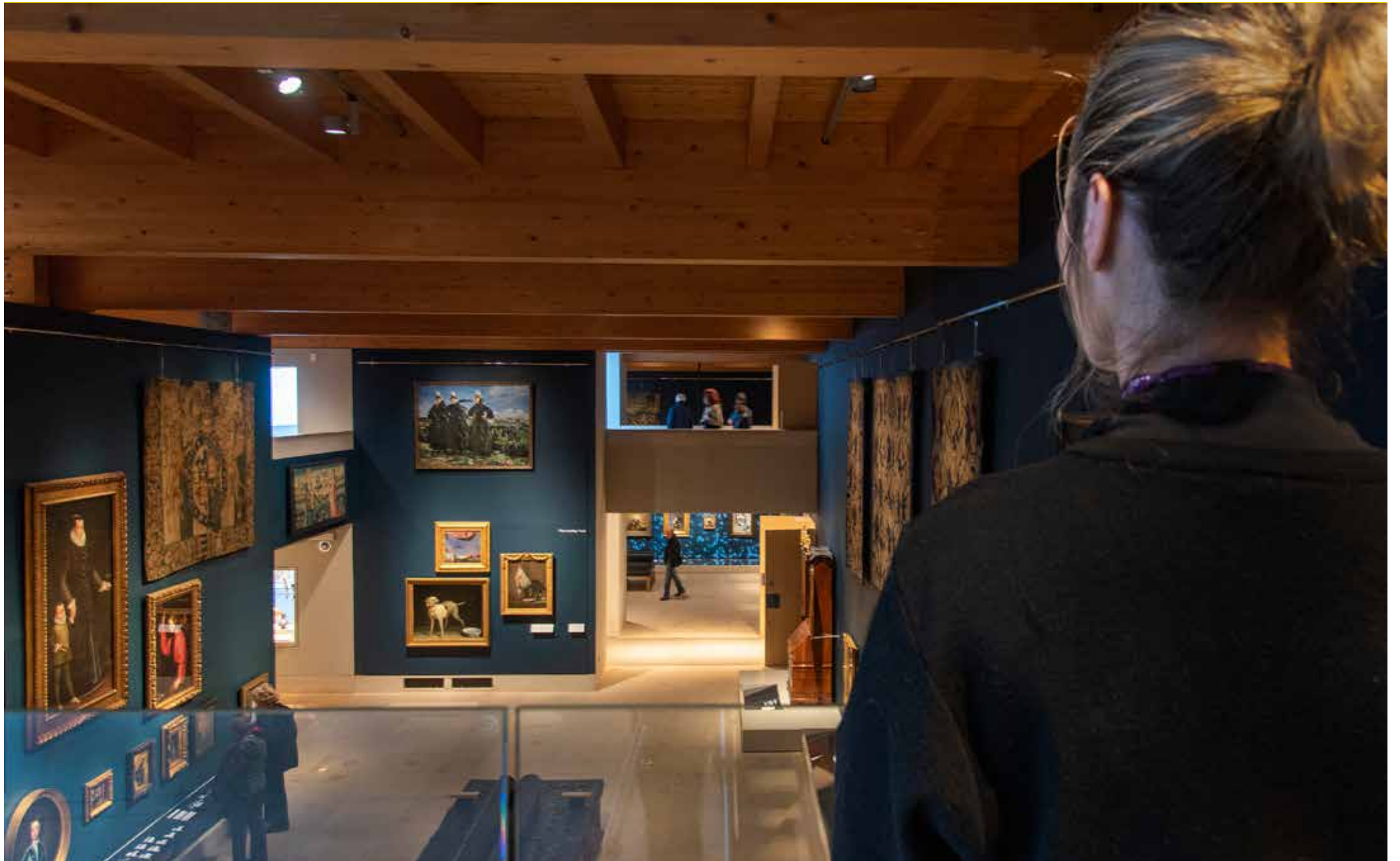
You can look down from the balconies.