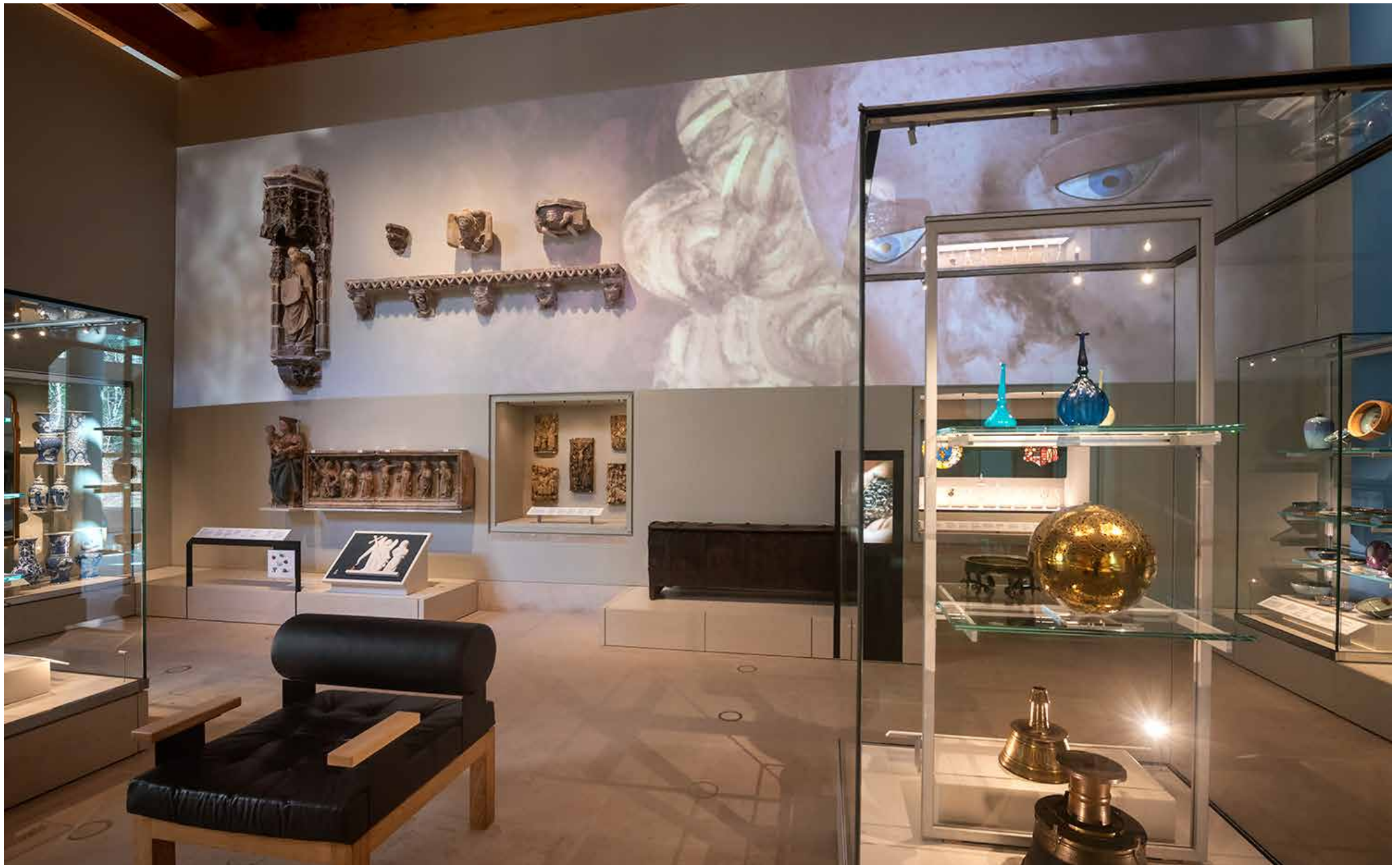
You can see films projected onto walls and you can hear voices and music.