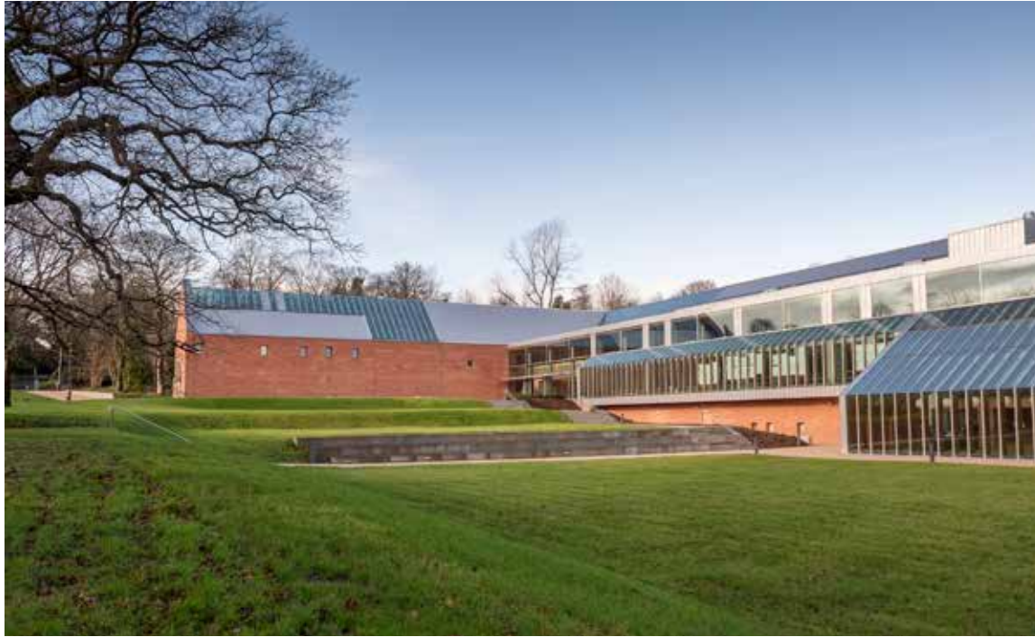
This is The Burrell Collection.